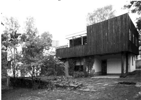
Figure 3. Aalto's Own House at Helsinki, Finland (1934-1936), on the left | Siza's Terraços de Bragança Residential Buildings at Lisbon, Portugal (1991-2004), on the right