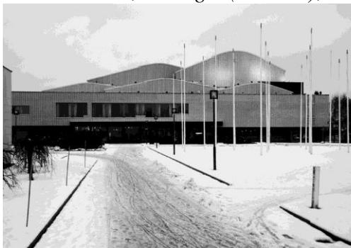
Figure 4. Aalto's 'Lappia' Radio Building and Theatre, at Rovaniemi, Finland (1969-1975), on the left | Siza's proposal model to the House of Architecture, at Matosinhos, Portugal (2007-...), on the right