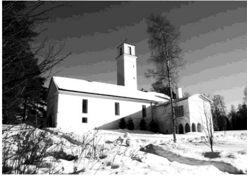
Figure 2. Aalto's Muurame Church, Finland (1926) on the left | Siza's Quinta da Conceição Swimming Pool at Leça da Palmeira, Portugal (1958-1965) on the right