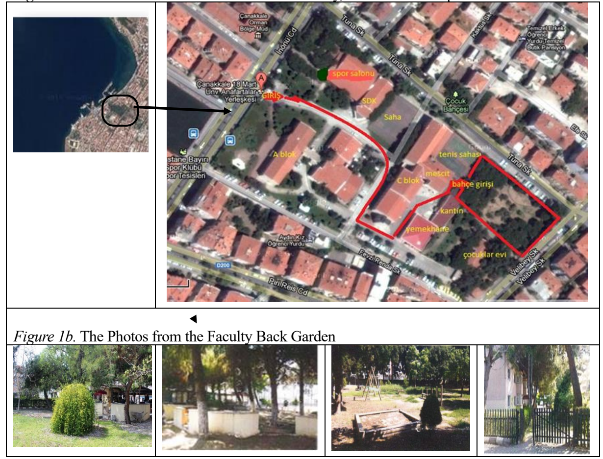
Figure 1a. The Location of COMU Education Faculty, Anafartalar Campus