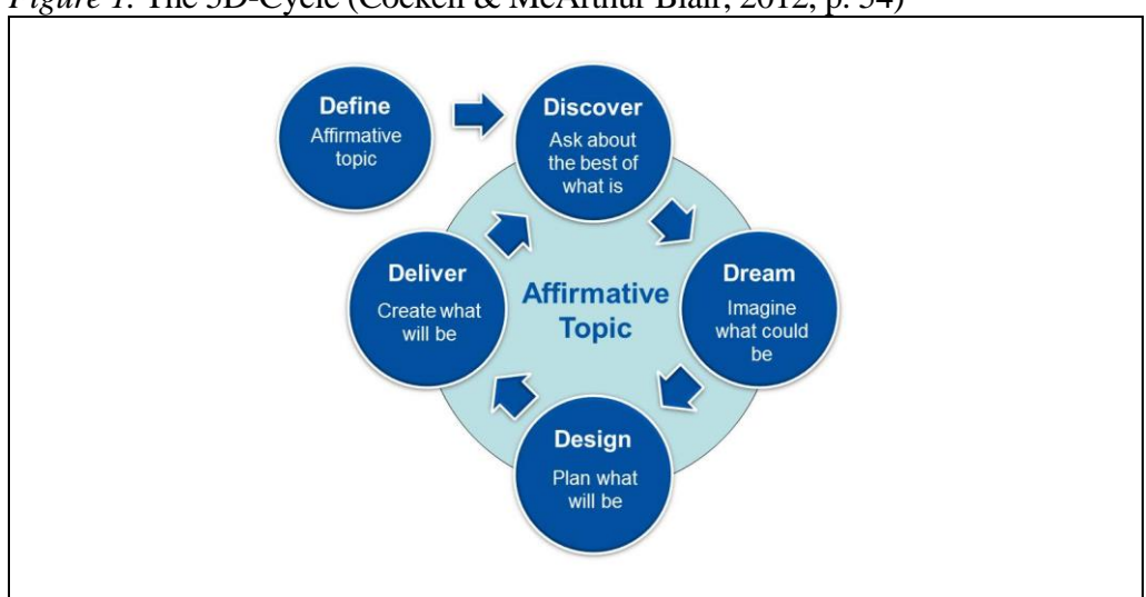
Figure 1. The 5D-Cycle (Cockell & McArthur Blair, 2012, p. 54)

The adoption of the AI is guided through two different phases. The first is the theoretical one and it is characterized by four principles: Constructionist; Simultaneity; Poetic; Anticipatory; Positiv of a social and collaborative co-construction of learning. The second is the operational phase. Either the first or the second underline the nature of the investigation for transformative purposes and are based on a circular process, known as "4D cycle" as it originates from the name of the individual corresponding phases, later integrated with one more preliminary phase (Cockell, & McArthur Blair, 2012) that take rise to the 5D-Cycle: