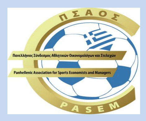
Panhellenic Association of Sports Economists & Managers (PASEM)