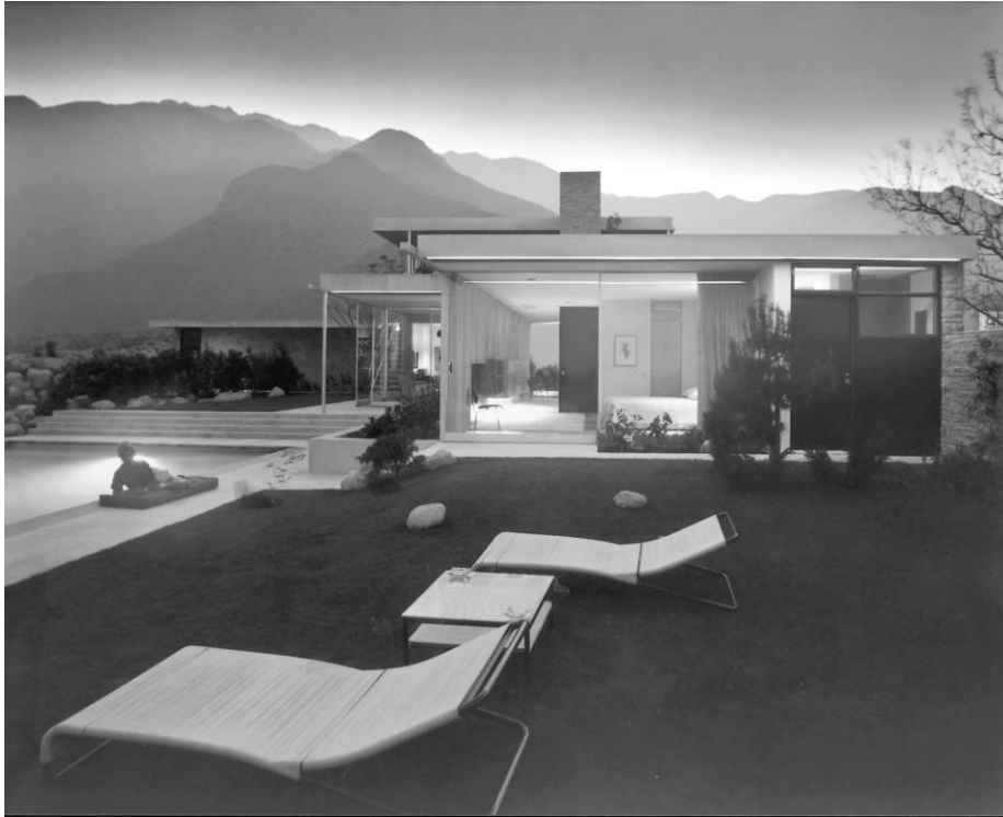
Figure 2. Shulman, J. (1947) Kaufman House, Palm Springs, California

Modern photographic theory appears to have flourished with the impact of the Bauhaus photography program and seminal essays such as Walter Benjamin's A Small History of Photography . 8 By the early 1980s, the field had expanded to include the classic Roland Barthes essay Camera Lucida , a meditation on form, content and meaning in photography. 9 Looking at, and thinking about photographs after his mother's death, he noted that all photographs are of something that has been but is no longer there - something that is already dead. Architectural photographs are of a like nature: the moment of the photograph, which architectural photographers sometimes call the "zero hour," is artificial in that it is immediately gone and beyond recovery. Further, with the passage of time, photographs become archival documents and hence, part of history. Barthes comments: "... I can never deny that the thing has been there. There is a superimposition here: of reality and the past. And since this constraint exists only for photography, we must consider it, by reduction, at the very essence ... of photography". 10 In Camera Lucida Barthes also mulled over two phenomena, which he called the studium and the punctum , to be found in photographic images. For him, the studium is the main visual form or dominant