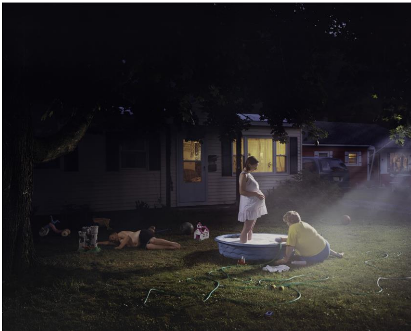
Figure 4. Crewdson, G (1999) Untitled

broken down into sections the size of large architectural constructions. There is a startling blend of the familiar and the unfamiliar in such weird, deconstructed assemblages that are simultaneously ship-like and building-like. They are an uncanny transmutation of Corbusier's 14 ocean liner archetype of the 1920s. "The uncanny," Johannes Binotto explains, is: "... not just the opposite of the familiarity of being "at home", but is the moment at which the seemingly familiar turns out to be unfamiliar, while, conversely, the seemingly unfamiliar unexpectedly appears familiar." 15 Current pre-occupations with uncanniness in photography make it tempting to think that the phenomenon is more endemic in photography than architecture. However, this imbalance could be of the present and may change, particularly as the range of available digital tools and effects increases in architecture. Significantly, there is an historical discourse on architectural uncanniness instanced in Anthony Vidler's 1992 study 16 of the "unhomely" for example and, added to that, there is Neil Denari's orientation to the "reality distortions project" which is of the moment.