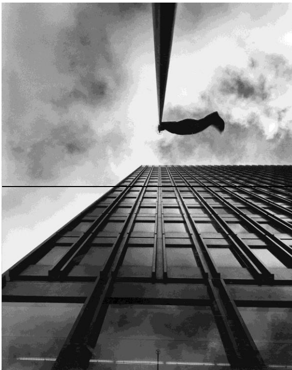
Figure 3. Sievers, W (1965) Royal Insurance Building, Collins Street, Melbourne

Barthes instanced this in a war picture by Koen Wessing where the studium comprises three soldiers patrolling a barricaded Nicaraguan street and, behind them, two nuns cross that same street and provide the punctum . Tension is evident. As Barthes says: " To recognise the studium is inevitably to encounter the photographer's intentions, to enter into harmony with them. " 11 The studium/punctum relationship generates a key part of image composition and meaning. Of course, image composition is something architecture and photography have in common. In architecture, it characteristically arises amid associated forms with the punctum allocated to an essential part of the program. In architectural photography it can occur in the residual space between forms. In this Wolfgang Sievers 12 picture (Figure 3) two perspectival forms rise through the frame - one light, one heavy, one in silhouette, the other not. The eye is drawn to the space between them.