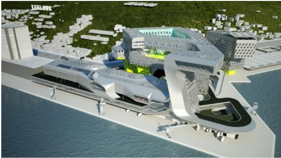
Figure 8. Denari, N (2017 projected) New Keelung Harbour Service Building, Taiwan

A century after its inception photography's visual properties showed up in architectural drawing practices, as the 1920s work of Mies van der Rohe attests. Whilst this was most evident in the presentation of architect's designs for most of the remaining century, in this century, photographic aesthetics and digital realisation are becoming established in the conceptualisation of architecture as well as its presentation. The architecture of Neil Denari and others illustrates this tendency.