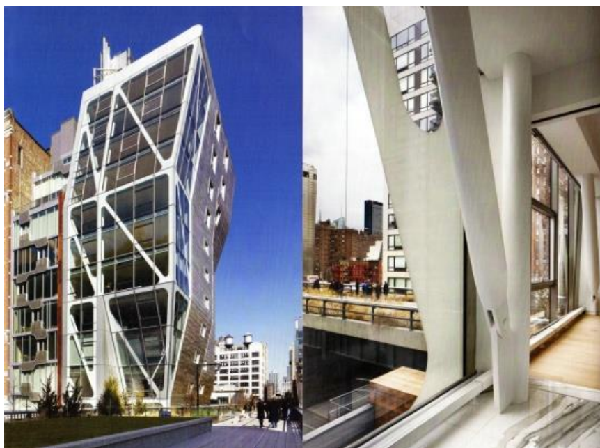
Figure 6. Denari, N (2005-12) HL-23, Exterior/Interior, New York

In a 2008 20 lecture espousing photographic metaphor, Neil Denari showed a VW logo beside a monochromatic axial photograph of a half-timbered German dwelling saying: "If on the one hand the Volkswagen logo is about a commercial, global world, it's also about a technique which is about trying to burn an image into one's eye." He continued that the half timbered façade works in the same optical way as the logo saying: "In terms of messages that they send, one is about offering a super graphical way of talking about structure, and the logo is about graphic, high contrast resonance. We'd like our work to borrow from both these paradigms." Further, he records an ambition to get, what he calls, "the Gursky effect" into his renders and buildings, referring to the work of the famous German photographer whose images are known for their graphic potency.