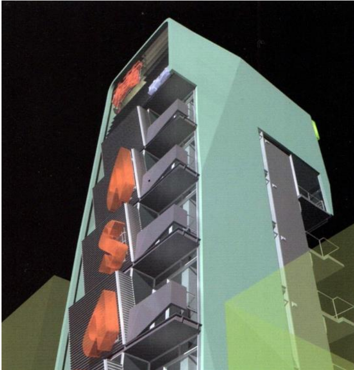
Figure 7. Denari, N (1999) Vertical Weekly Mansion, Tokyo

creating "reality distortion" projects (alluding to the Reality Distortion Field effect at Apple in the 1980s where engineers worked hard on their ideas only to find the best ended being Steve Job's big idea). Denari is also interested in Jeff Walls' pre-figuration of his pictures, and Gregory Crewdson's intricately planned "construction" of photographs using story-boards, sets, lighting and actors 23 . In all this Denari, looks to expand architecture's field of referentiality to include that which is graphic and high-impact - not to mention scripted and structured like a movie (Figure 7). His is also a prescription that abrogates the architectural default strategy of merely "... holding a mirror up to the world."