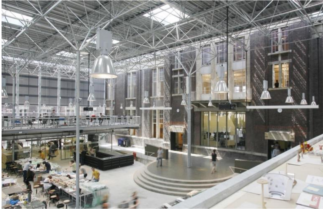
Figure 4. Delft, Model Hall for Architectural Students in Newly Added Glass Cube, Part of the Adaptation to BK-City as Designed by Job Roos (Braaksma & Roos) and Octacube