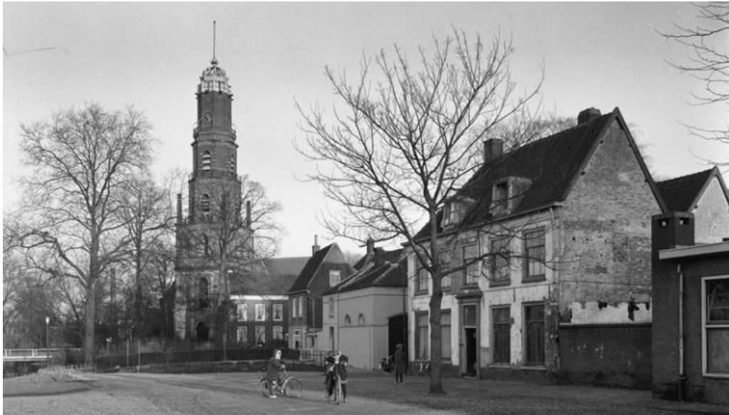
Figure 2. IJsselstein, the Renaissance Tower of the Dutch Reformed or Old Saint Nicholas Church, Designed by A. Pasqualini (1532-35) with Expressionist Spire by Michel de Klerk as Post-Fire Restoration (1921-23) in 1962

‘restoration’ assignment, acceptable to both conservation and contemporary architecture proponents only by virtue of its artistic merit (Figure 2). 26