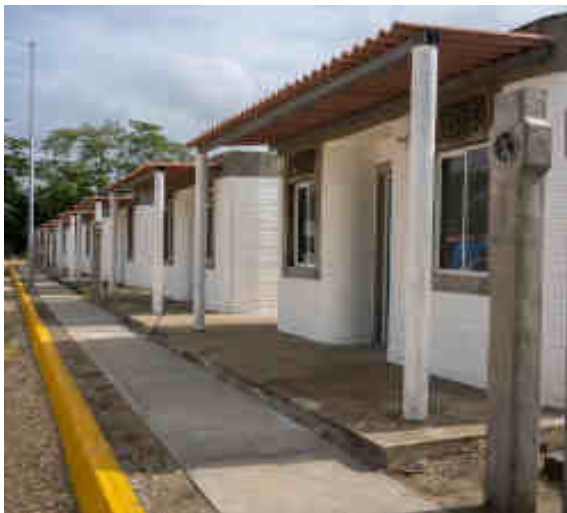
Figure 4. Three-Dimensional Printed Houses in Nacajuca, Mexico 84

As a result of climate change, particularly the possibility that the increase of more than 1.5 degrees Celsius above preindustrial levels by 2030 ensuing from a