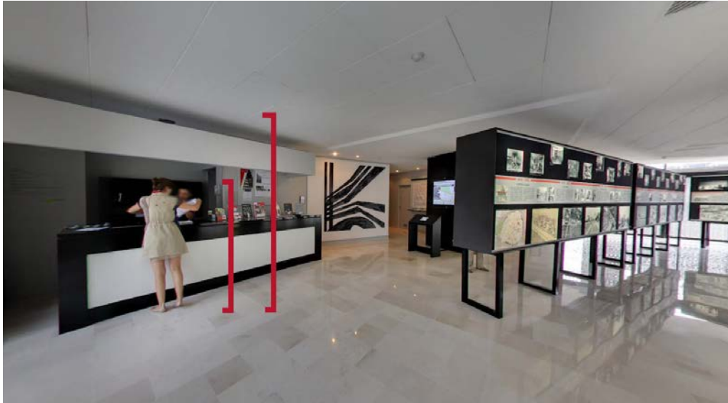
Figure 3. The Red Marks Show that it is Designed in Human-Scale