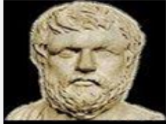
Xenophon (b.430 BC) Author of Oeconomicus & Peroi