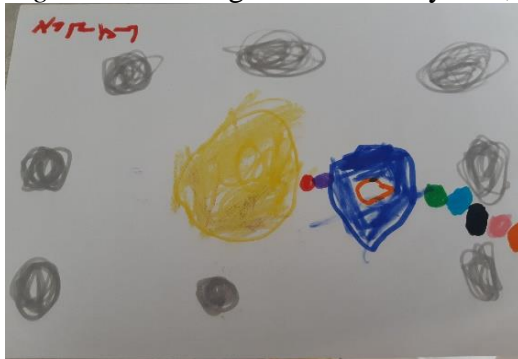
Figure 3. Drawing of the Solar System, after the Intervention

Figure 4 shows the drawing made by a third child (a girl) following the intervention. A large object, not drawn in the center of the page, extends beyond the edge of the page. Its shape is round, and is colored in red, orange and yellow, colors that symbolize light and heat. This represents the Sun. Around this body, are drawn circles in pencil, indicating a path of movement. This girl demonstrated her understanding that each of the planets has its own orbit at a more or less