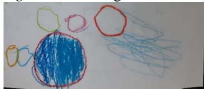
Figure 1. Drawing of the Earth, before the intervention

In one activity, the children were asked to draw the Earth. The drawing shown in Figure 1 was made by a girl prior to the intervention program. She drew a collection of circular shapes. The girl seems to have drawn from her imagination and not from any knowledge.