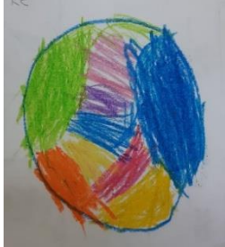
Figure 2. Drawing of the Earth, after the intervention

In another activity, the children were asked to draw the solar system. The drawing shown in Figure 3 was made by a second child (a boy), who drew the Sun in the center and larger than the other objects - the planets. He colored the Sun yellow, signifying light and heat. Each planet is painted in a different color and at a different distance from the Sun, which indicates that he understands there are multiple bodies in the solar system, and each one is at a different distance from the central body. The Earth is colored blue and it is the third in the series. In the background, he drew stars as round, gray shapes. The child demonstrated a basic understanding of the structure of the solar system, in which the star of the Sun is the central body and at different distances from it there are planets, each of which has a characteristic size. In addition, the child demonstrated his knowledge that there are other stars in space.