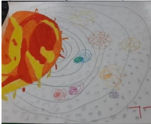
Figure 4. Drawing of the Solar System, after the Intervention

The children were asked to draw the Moon. In this drawing by a fifth child in the class (a boy) the Moon is painted as a yellow circle.