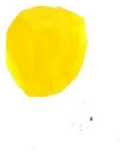
Figure 5. Drawing of the Moon, Before the Intervention

The drawing in Figure 6 was made by the same child who painted Figure 5. This time, when the children were asked to draw the Moon, the boy drew four circles in pencil. Part of each circle was painted in yellow, indicating the visible part of the Moon, and part is painted black, indicating the unseen part. In this work, the child demonstrated a change in his perception of the Moon. He expressed the idea that the way the Moon looks can change.