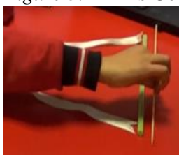
Figure 3. Mert's Comparison of the Lengths of the Ribbon and Pipette