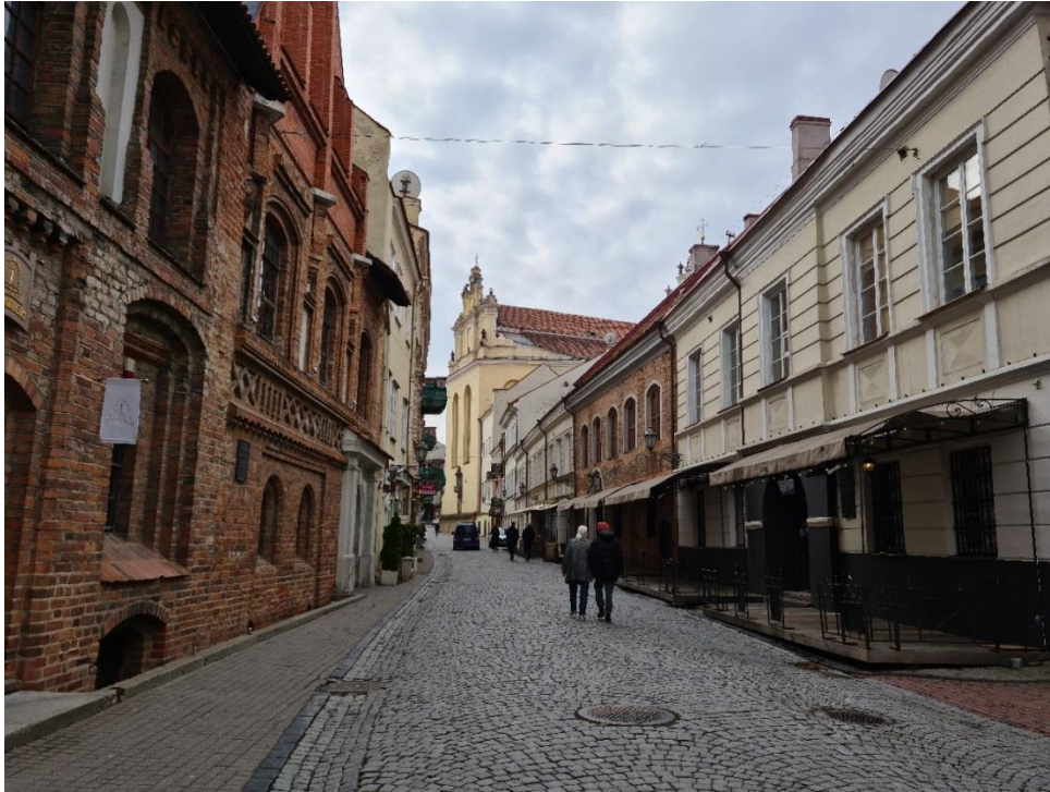
Figure 2. Pilies Street Segment and the Church of St John