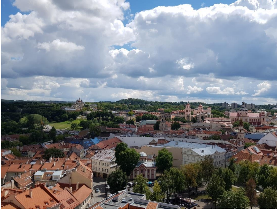
Figure 3. The Church of St Paraskevi and the Southeast Part of Vilnius Old Town

new city is shown by the fact that roads from two directions, Minsk and Polotsk (present-day Belarus), intersect there. 58 In this way it is possible to date this segment of Pilies Street between the Catholic Church of St John and the Orthodox Church of St Paraskevi to the first half or mid-14 th century.