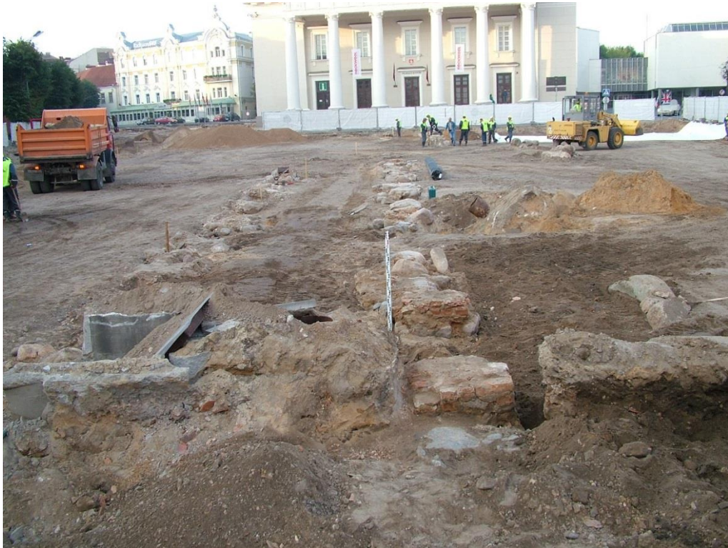
Figure 4. Archaeological Excavations at Rotušės Square, 2005