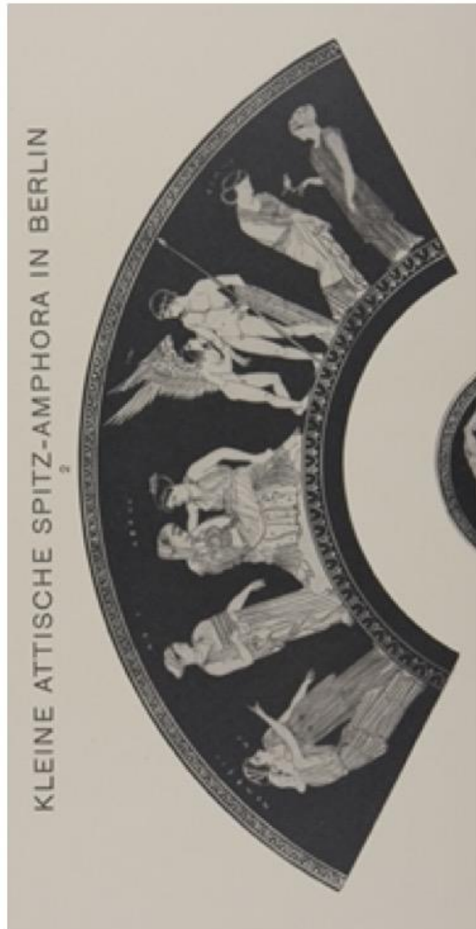
Figure 2. Amphoriskos by Heimarme Painter Source: Berlin-Staatliche Antikensammlung 30036 (c. 430-420 BC).