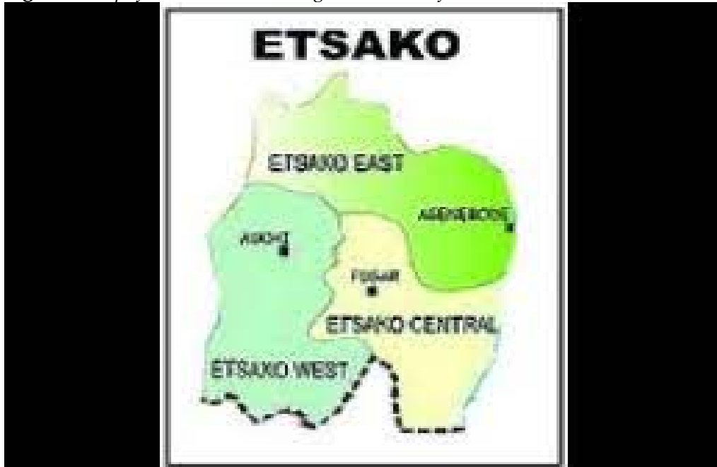
Figure 2. Map of Etsako Land Showing the Location of Auchi, Edo State