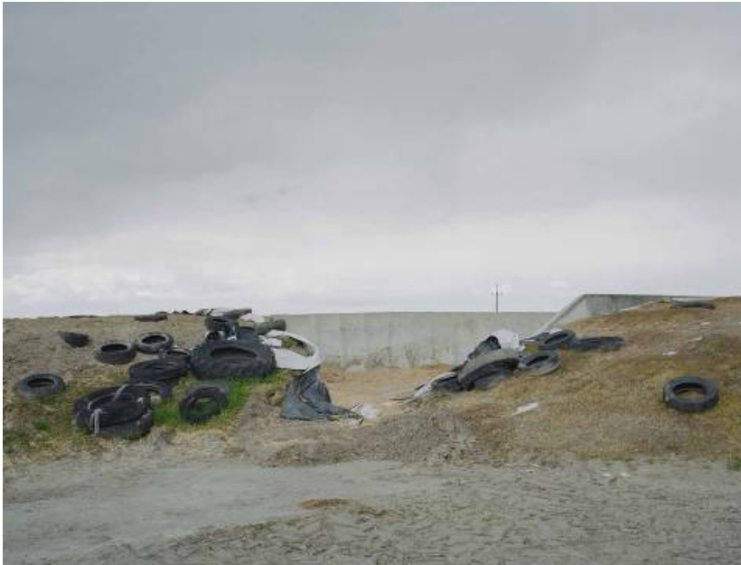
Figure 5. Michał Woroniak, Harvest , 2017

The third example that I want to present in the paper is the project titled Harvest by Michał Woroniak. The photographer chooses a different narrative strategy from the other, described above, two authors. The presentation of works chosen by Woroniak is intended for the exhibition in the gallery. Colorful frames, enlarged in various scales, are hung at various heights. The visitor's view wanders between frames in a non-linear way, focusing on the characteristic elements of the images, as well as in accordance with the “walking” route chosen by the recipient. Photographs were taken in three small towns of southern Wielkopolska (Krobia, Poniec and Miejska Górką). That area in the Polish geographical imagination represented fertile lands. However, the discovery of lignite deposits encourages investors to transform this area into mining areas (Figure 5).