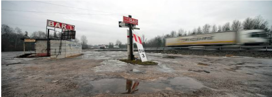
Figure 3. Maciej Rawluk, Motorway No. 1 , 2014