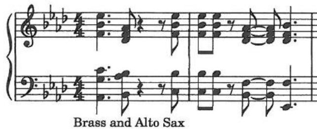
Figure 2. Quoted material used in “ Surrey with the Fringe on Top ” from 2:09 on Mel Tormé recording

As one can see, the quote in figure 2 is just two measures in length and is in the same key as the original. Paich keeps the rhythm and the melody the same but alters the harmony so that it fits more closely with the chord progression of “ Surrey with the Fringe on Top ”. It is worth noting that the quote also serves a functional role in establishing a new key. The Paich arrangement was pitched in G major until 2:09 on the recording when the “ Godchild ” quote is introduced, putting the new key in A flat major, which continues until the end of the piece.