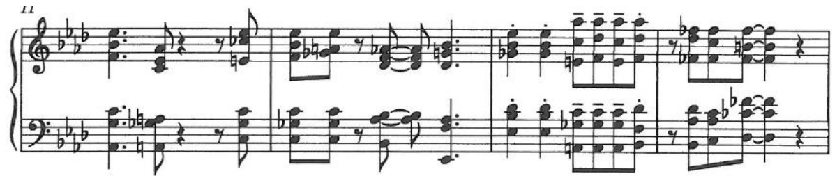
Figure 1. Original Birth of the Cool “Shout Chorus” Material from m.103-106 in Godchild

Original material copied from original score (Davis, 2002)