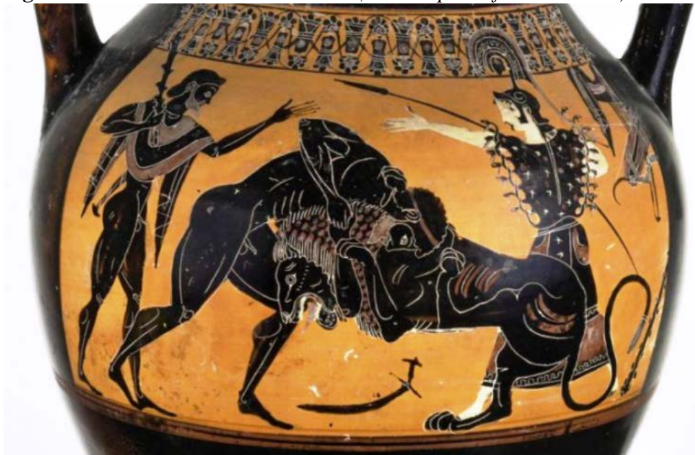
Figure 2. Heracles and the Nemean Lion (Attic Amphora from Cerveteri)

Rereading this story in parallel with that of Samson, it becomes clear that the metaphor is analogous, and indeed in the case of the biblical hero it appears much more explicit, albeit through the cover of the riddle (which, moreover, seems to attest to the awareness of who first told the episode).