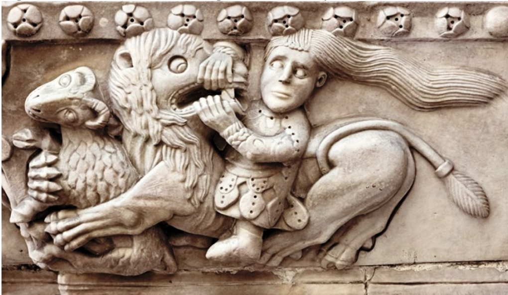
Figure 1. Samson Tears the Lion Apart (Cathedral of San Lorenzo, Genoa)

Behind the apparent strangeness of this story, the suspicion immediately arises that it is a complex metaphor whose real meaning is hidden or lost over time.