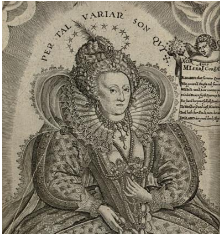
Figure 5. Posthumous Image of the Queen by Nicholas Hilliard 12 for Camden's Annales (1617–1619)