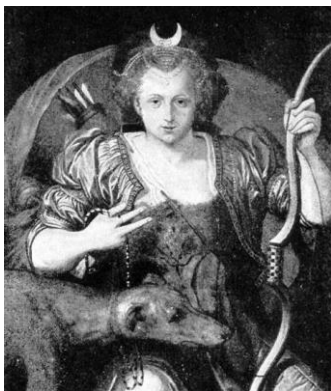
Figure 4. Queen Elizabeth I as Diana by Frans Floris or Martin de Vos

Source: The collection of the Marques of Salisbury, Hatfield House.