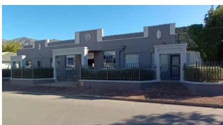
a Figure 11.4 a. Erstwhile Venus Cinema, Montagu b. Current façade of erstwhile Venus Cinema