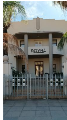
13 14 a b