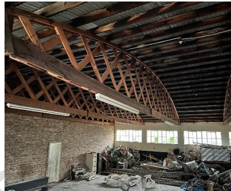
5 6 a b 7 Figure 8.4a. Market Building, KwaNojoli, Louis Trichardt Street, KwaNojoli 8 9 b. Market Building interior 10 11