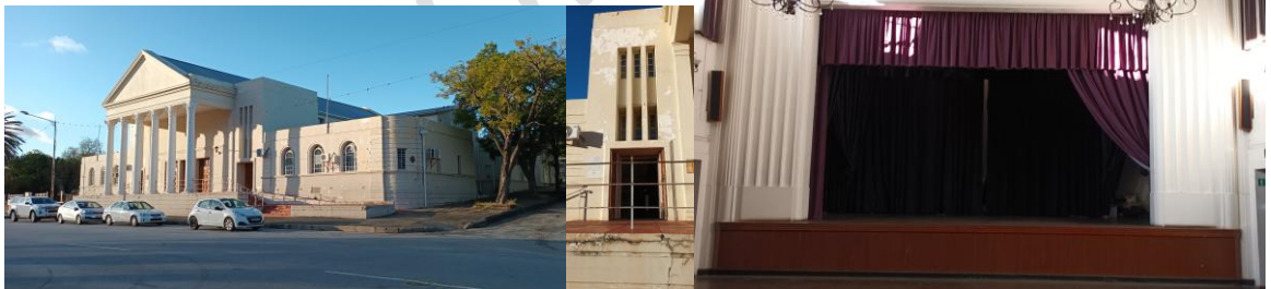
10 11 a 12 Figure 8.2a. KwaNojoli Town Hall, KwaNojoli 13 Photograph by author. 14 b. KwaNojoli, Fasade detail 15 Photograph by author. 16 c. KwaNojoli Town Hall, Proscenium 17 Photograph by author. 18