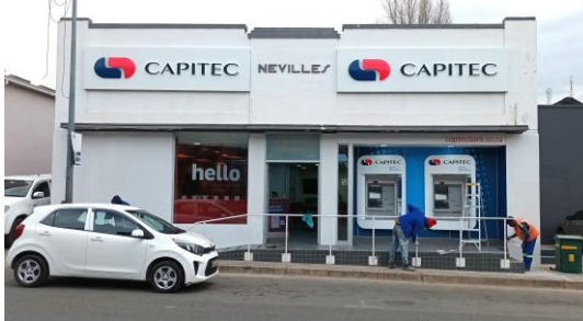
4 5 Figure 4.2. 15 Church Street, Colesburg 6