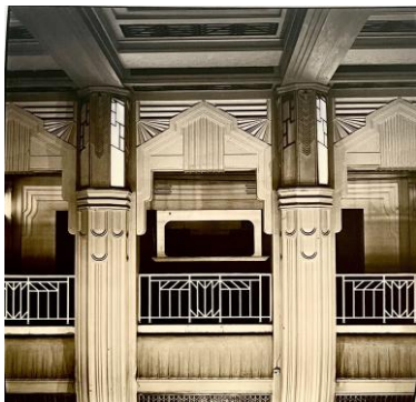
15 16 Figure 6. Colosseum Mezzanine 1933 by P. Rogers-Cooke 17 Photograph by Leon Krige. 44

4 Freschi 40 notes that Johannesburg adopted the Art Deco style somewhat later 5 than many international centres. While Art Deco's global prominence spanned 6 roughly from the mid-1920s to the late 1930s, 41 most of Johannesburg's 7 examples were constructed during the 1930s. Nevertheless, Art Deco buildings 8 are widespread across South Africa's major cities and towns and span a broad 9 array of functions—including industrial facilities, commercial offices, 10 monuments, religious institutions, retail spaces, 42 and perhaps most iconically, 11 cinemas such as Johannesburg's Colosseum Theatre (Figure 6) 43 . Van der 12 Linde's thesis offers an extensive inventory and analysis of these architectural 13 works