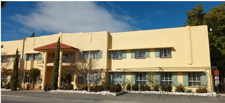
6 Figure 3.1 a. Transkaroo Country Lodge: Original façade.

7