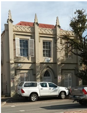
6 7 Figure 13.2. 63 Baron Van Reede Street, Oudtshoorn 8