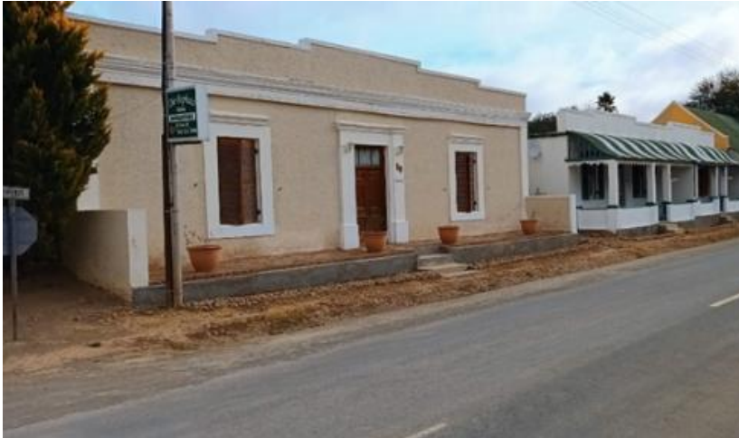
1 2 Figure 7. Brakdak or Karoostyle house in Victoria West. 3  4

5 Many towns in the Karoo, including Montagu and Prince Albert, were founded 6 around the mid-nineteenth century. Although flat-roofed Karoostyle dwellings likely 7 predate the formal establishment of these settlements, they were among the first 8 architectural forms used in their initial development. In places such as Montagu and 9 Graaff-Reinet, early townscapes also featured several Cape Dutch-style houses. As 10 these towns evolved, later phases of urban growth introduced Georgian or Cape 11 Georgian architecture. Noteworthy surviving examples of this stylistic shift include 12 40 Long Street in Montagu (Figure 8) and the Graaff-Reinet Club (Figure 9). Cape 13 Georgian, was a new classical style adopted in these regions and marked by a 14 restrained and thoughtful approach, aimed at innovation rather than merely replicating 15 historic models. 62 Japha and Japha, following the lead of Franzen and Cook suggest 16 that this type of classification (Georgian) will lead to confusion and suggest that 17 buildings of this style and the Karoostyle should rather be referred to as ‘Single-storey 18 parapet houses’. 63 19