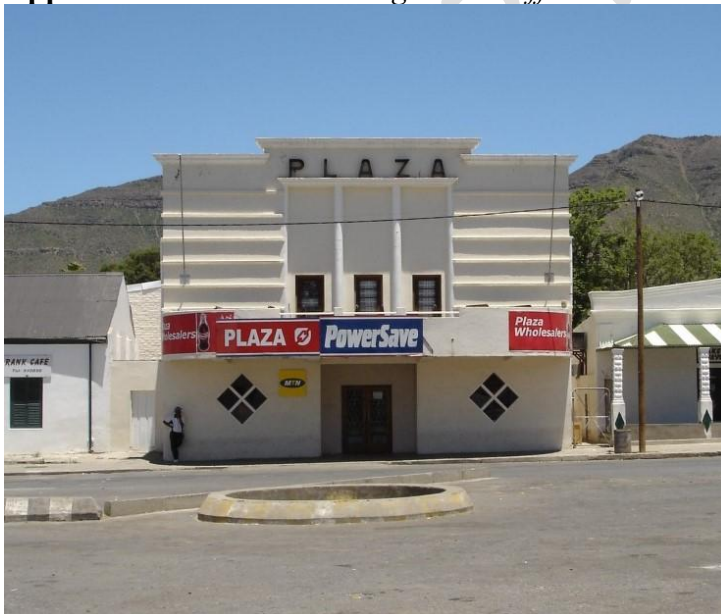
9 10 Figure 5.1. Plaza Cinema, 24 Market Square, Graaff Reinet 11 12