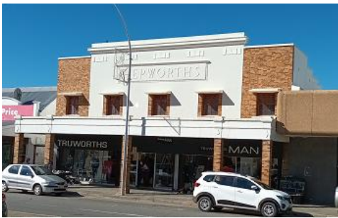
5 6 Figure 5.3. Hepworths Building, 27 Caledon Street, Graaff Reinet 7  8