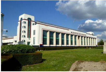
1 2 Figure 2. Hoover Building London (1933) by Wallis, Gilbert and Partners. 3 Photograph by Ethan Doyle White 4 Source: Wikipedia, b. 20