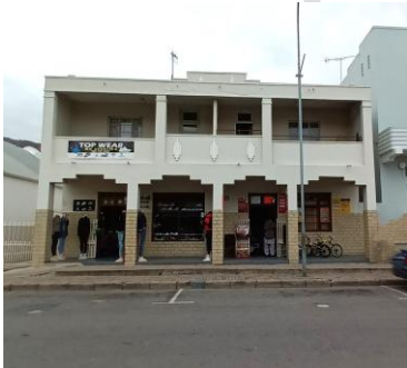
Figure 11.2. 41 Bath Street, Montagu