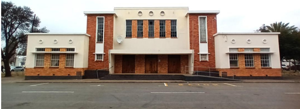
Figure 9.2. 7 South Street, Ladysmith Appendix 10. Art Deco building in Middelburg.