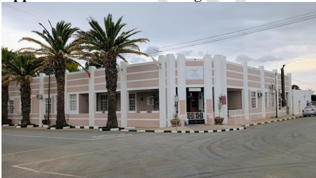
10 11 Figure 6.1. The Hanover Hotel, Hanover. 12 13 14