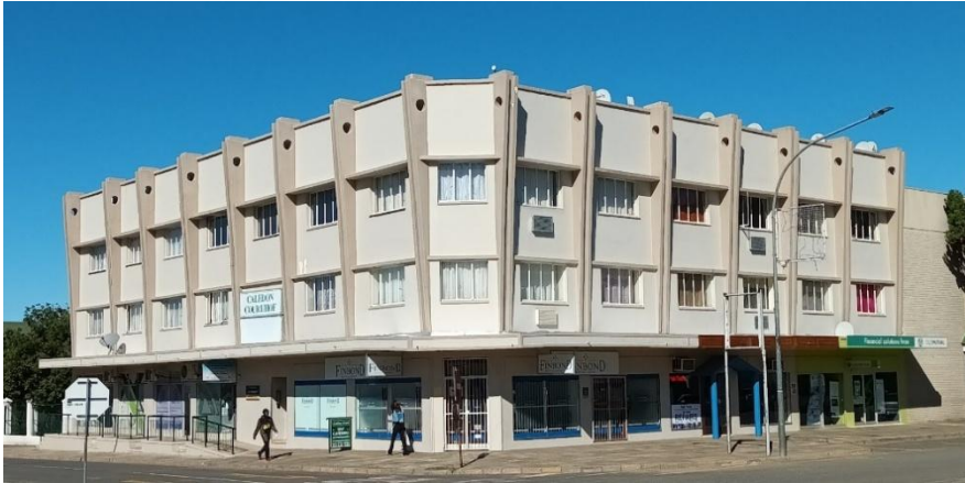
1 2 Figure 5.2. Caledon Court, 8 Church Street, Graaff Reinet 3 4