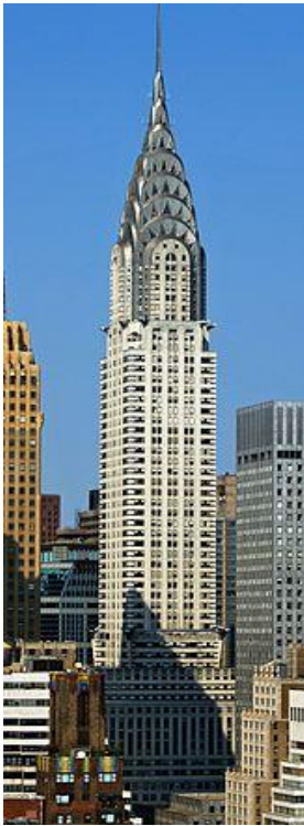
20 21 Figure 1. Chrysler Building New York, (1939) by William van Alen. Photograph 22 by David Shankbone 23 Source: Wikipedia, a. 19

10 11 Van der Linde 18 identified several defining features of Art Deco architecture. These 12 include a pronounced emphasis on verticality, often balanced by strong horizontal 13 elements that serve either as counterpoints or as distinct design features in their 14 own right. Building façades frequently incorporate setbacks or stepped forms 15 reminiscent of ziggurats. Geometric patterns and shapes play a significant role in 16 the visual language of Art Deco, along with the use of decorative parapets and flat 17 roofs. Ornamentation is typically stylized in the characteristic Art Deco manner, 18 while chevron motifs commonly featured as a decorative staple. 19