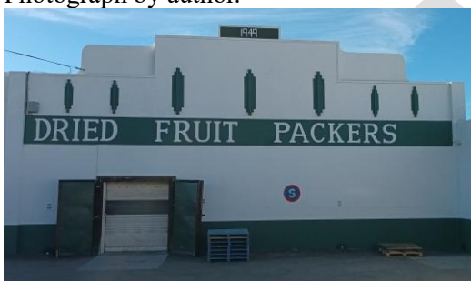
Figure 11.5. 42 Piet Retief Street, Montagu