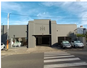
10 11 Figure 13.3. 113 Adderley Street, Oudtshoorn 12