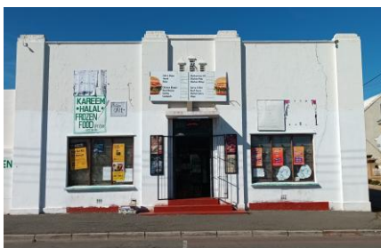
14 15 Figure 13.4. 6 High Street, Oudtshoorn 16