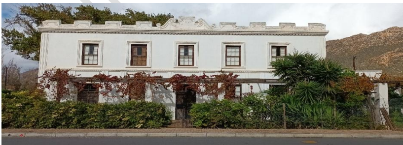
20 21 Figure 8. 40 Long Street; Cape Georgian house in Montagu. 22

5 Many towns in the Karoo, including Montagu and Prince Albert, were founded 6 around the mid-nineteenth century. Although flat-roofed Karoostyle dwellings likely 7 predate the formal establishment of these settlements, they were among the first 8 architectural forms used in their initial development. In places such as Montagu and 9 Graaff-Reinet, early townscapes also featured several Cape Dutch-style houses. As 10 these towns evolved, later phases of urban growth introduced Georgian or Cape 11 Georgian architecture. Noteworthy surviving examples of this stylistic shift include 12 40 Long Street in Montagu (Figure 8) and the Graaff-Reinet Club (Figure 9). Cape 13 Georgian, was a new classical style adopted in these regions and marked by a 14 restrained and thoughtful approach, aimed at innovation rather than merely replicating 15 historic models. 62 Japha and Japha, following the lead of Franzen and Cook suggest 16 that this type of classification (Georgian) will lead to confusion and suggest that 17 buildings of this style and the Karoostyle should rather be referred to as ‘Single-storey 18 parapet houses’. 63 19