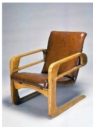
10 11 Figure 4. Armchair ("Airline Chair") 1934–1935 by Kem Weber (Brooklyn 12 Museum). Photographer unknown 13 Source: Wikipedia, d. 22 14

15 The Pennsylvania Historical and Museum Commission (2015) highlights 16 Art Deco's sleek, linear aesthetic, the use of low-relief decorative panels at key 17 architectural junctures such as entrances and rooflines, and a smooth building 18 finish. The Encyclopaedia Britannica ([s.a.]) adds an admiration for modernity 19 and the machine age, reflected in design traits like simplicity, symmetry, 20 planarity, and streamlined forms reminiscent of ocean liners.