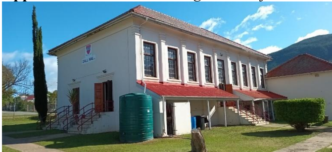
7 8 Figure 8.1. Gill College, Gall Hall, KwaNojoli 9