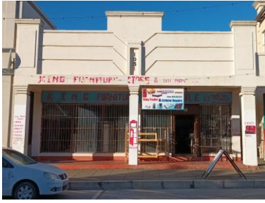
1 2 Figure 8.3. 90 Nojoli Street, KwaNojoli 3 4