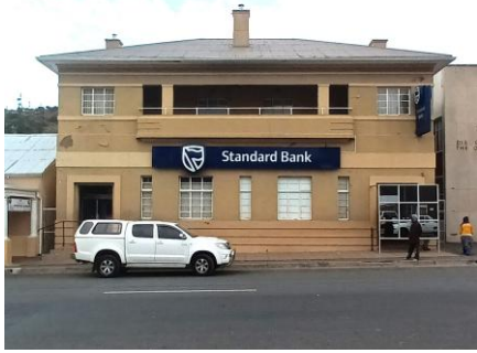
2 3 Figure 4.1. 26 Church Street, Colesburg