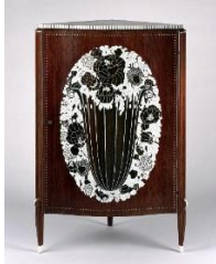
5 6 Figure 3. Coner Cabinet with amaranth veneer on mahogany, ivory inlay, (1923) 7 by Émile-Jacques Ruhlmann (Brooklyn Museum). Photographer unknown 8 Source: Wikipedia, c. 21 9