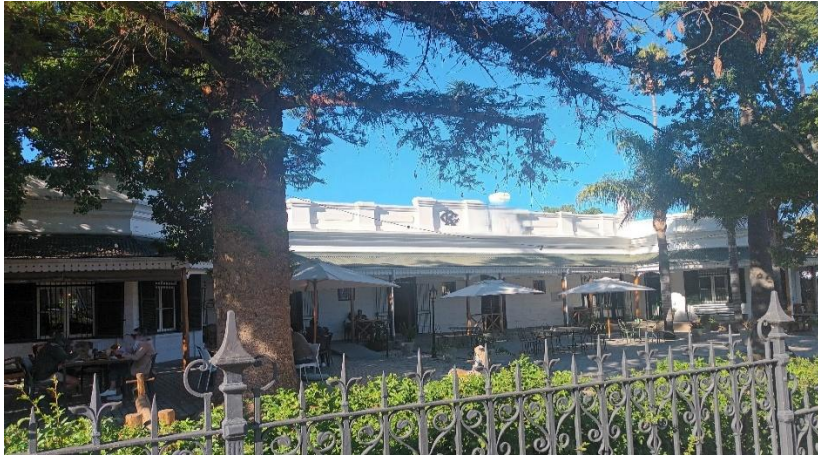
1 2 Figure 9. Graaff Reinet Club