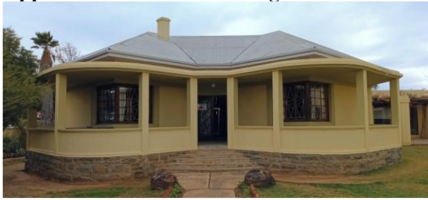
2 3 Figure 7.1. House Sid Fourie 4 5