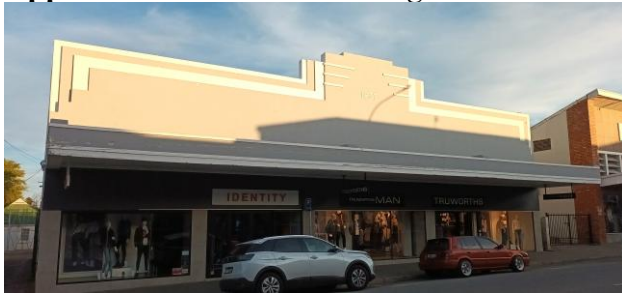
2 3 Figure 13.1. 110 High Street, Oudtshoorn 4