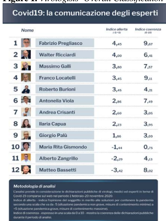
Figure 1. Virologists’ Overall Classification

To better comprehend which scientists are involved in our exploration among the few who have progressively exposed disseminating their expertise on social media throughout 2020, we referred to a recent study by Reputation Science , a research center specialized in crisis management consulting, particularly in the scientific context.