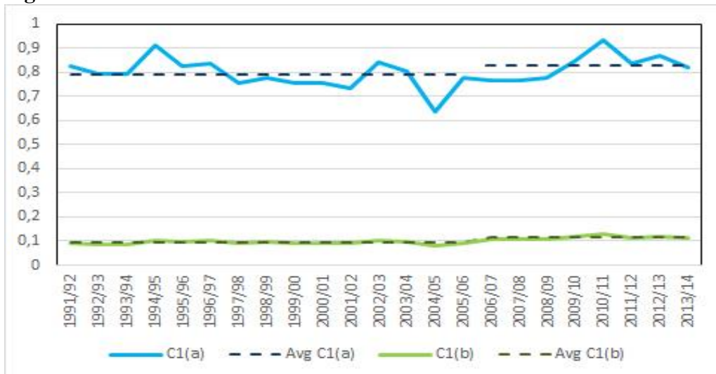
Figure 2. Results Concentration Index C1

Figure 1 represents the C3 index, calculated from the two different methodologies. The season of the reduction was in 2006/07 and both in C3(a) and in C3(b) it is possible to observe an increase in the indices, summarized by the increase in the average of the indices of both periods (first period with 18 teams and second period with 16 teams). This means that the top 3 teams in the final standings won relatively even more points after the reduction than before.