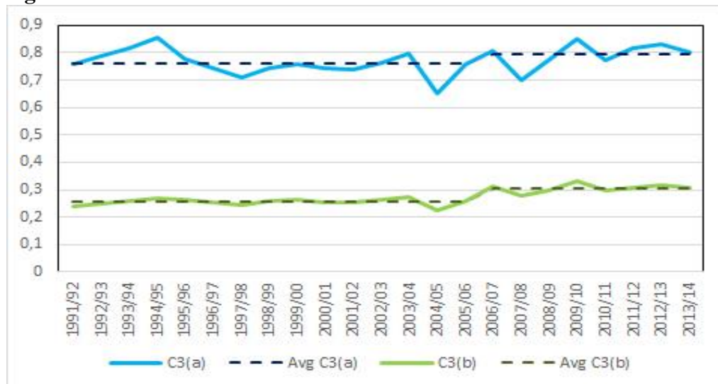
Figure 1. Results Concentration Index C3