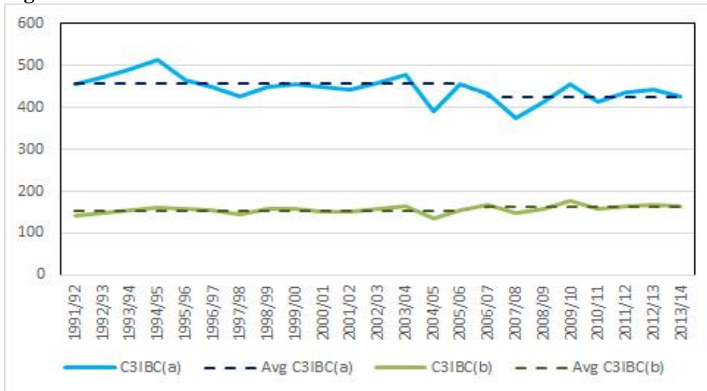
Figure 3. Results Concentration Index C3IBC

Even though this is clearly more evident in the C1(a) situation, in C1(b) the increase has a magnitude of 21.64%.