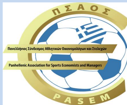
Panhellenic Association of Sports Economists & Managers (PASEM)