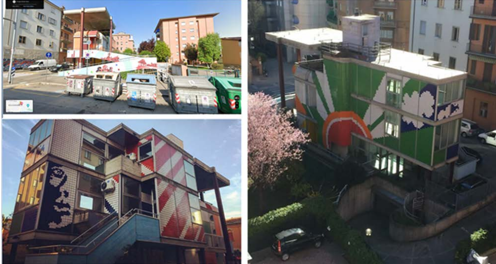
Figure 3. The Former Neighbourhood Library (Biblioteca Pelagalli), then Nursery School until 2012 – Current Headquarters of Hex, a Coworking Association, Privately Owned

Table 3 reports the model input data of physical properties for the real tiles (Ex Ante, EA), the simulation performed by changing only the albedo values of tiles incrementing it by a 10% (Ex Post only Albedo, EPA), and the input data of the expected physical characteristics of the new tiles also incremented of 10% in the albedo values and imposed the new emissivity values at 0.90 for all the tiles of various colours (Ex Post Potential, PEP).