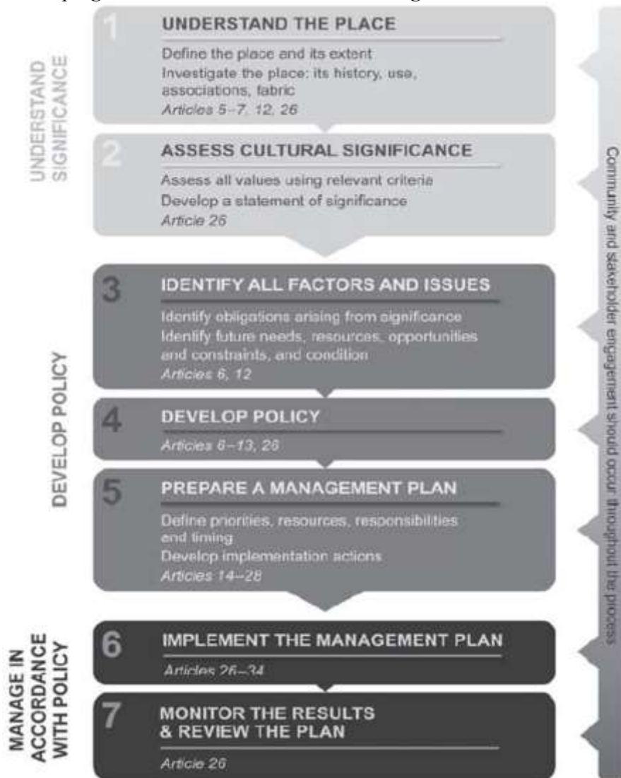
Figure 1. Community Involvement in Understanding Heritage Significance and Developing its Conservation Policies According to ‘The Burra Charter Process’

perform the conservation process in the site of cultural significance through teams including managers, owners, stakeholders and the inhabitants. This Convention clarifies the role of the locals through utilising the term “ place ”, which involves diverse matters, including the local views and social effectiveness with their interrelated cultural traditions that together lead the heritage preservation works to accomplish their results. Consequently, it emphasises the necessity of local involvement in heritage conservation processes from the base to the top of formulation and implementation of the heritage conservation policies that are clearly cited in the general process of the Burra Charter (Figure 1).