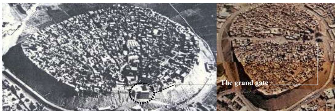
Figure 2. “Left”: The Citadel In 1951, Before The Renovation; “Right”: The Citadel After Renovation