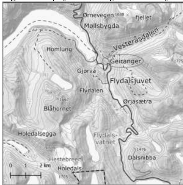
Figure 1. Map of the Geiranger Area as Defined in the Study